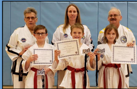
Many of our Taekwondo students tested and received belt promotions