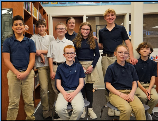
Our middle school speech and debate team had another excellent season, competing in a multitude of meets throughout the state.