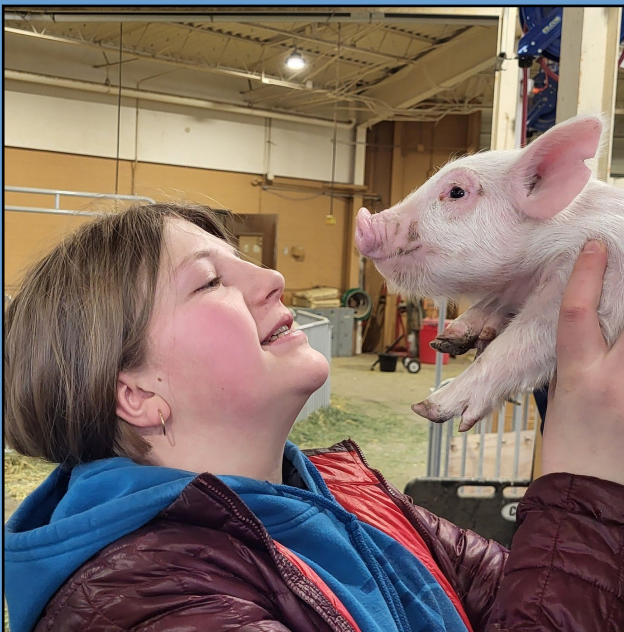
In February, we celebrated and hosted national FFA week for our local chapters. Students in our Agriculture class also had the opportunity to visit Casper College and see all the babies that were born recently.