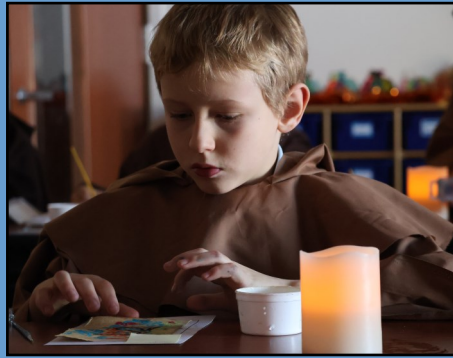
Third graders had the opportunity to live like monks and nuns for a day.