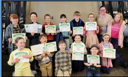
Students in 4th and 5th grades represented our school at the NCSD Science Fair.