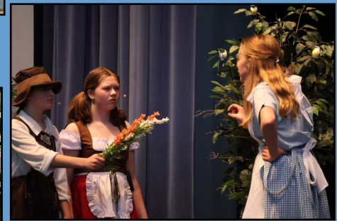
Thanks to a grant from the Goodstein Foundation, we were able to procure new wireless microphones that helped make our middle school production of The Trial of Goldilocks a wonderful evening of theater.