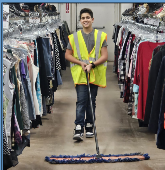
Students in grades 4 through 8 served at a number of non-profits while Kindergarten through 2nd made gifts for those in need.