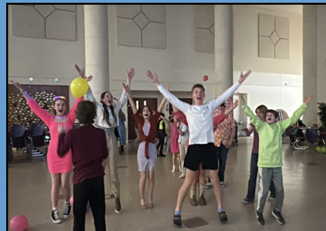
The YMCA dance never goes out of style and is always a favorite at our middle school dances. Our Catholic School's Week dance marks the first of two dances that our middle schoolers have an opportunity to plan, decorate for and enjoy.