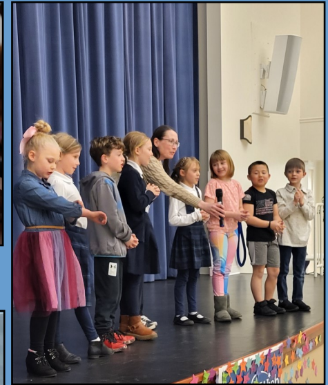
Our annual poetry night is always a wonderful opportunity for our students to express their creativity and become more proficient public speakers.