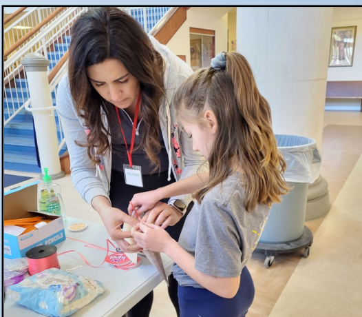
Students in grades kindergarten-2nd grade made hot cocoa bags for local police officers, firefighters and EMS workers.