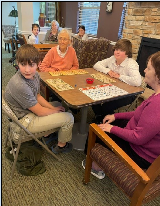
Middle School students play bingo with nursing home residents.

Thank you to all that made this week possible. Our parents, teachers, staff and community volunteers are the backbone of everything we do at St. Anthony Tri-Parish Catholic School.