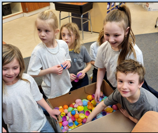
Above: 1st graders matched plastic eggs for an upcoming community Easter Egg Hunt.