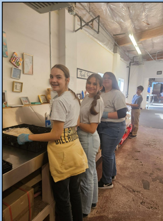
Below: Middle School students pack food bags at Joshua's Storehouse.