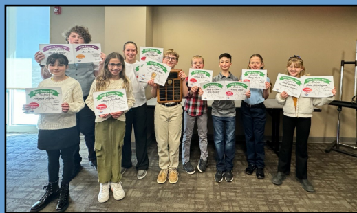
St. Anthony's students at the Natrona County School District Science Fair held in January.