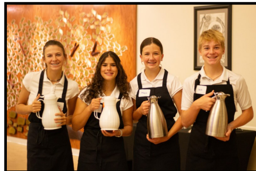
Middle school servers.

Thank you to all who came out in support of our students. We are indeed blessed.